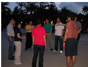
Preparing to get into action during a teambuilding game