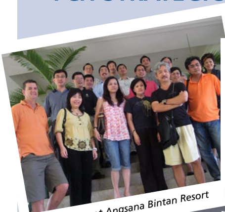
Group photo at Angsana Bintan Resort