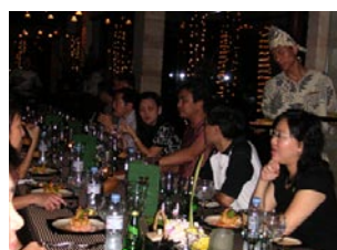
Dinner at Tree Tops Restaurant in Banyan Tree

Deliberately named a strategic management "attack" (instead of using the term "retreat"), a three day getaway to Bintan, Indonesia was conducted for the key management team of YCH to establish the strategic direction and formulate growth plans for the company moving forward. Focal themes arising from the strategic management "attack" this year include the importance of acquiring cross-functional expertise and understanding, having a well-integrated centre of control and leadership, and building a strong network of customers and suppliers through sincere, engaging and mutually beneficial partnerships.