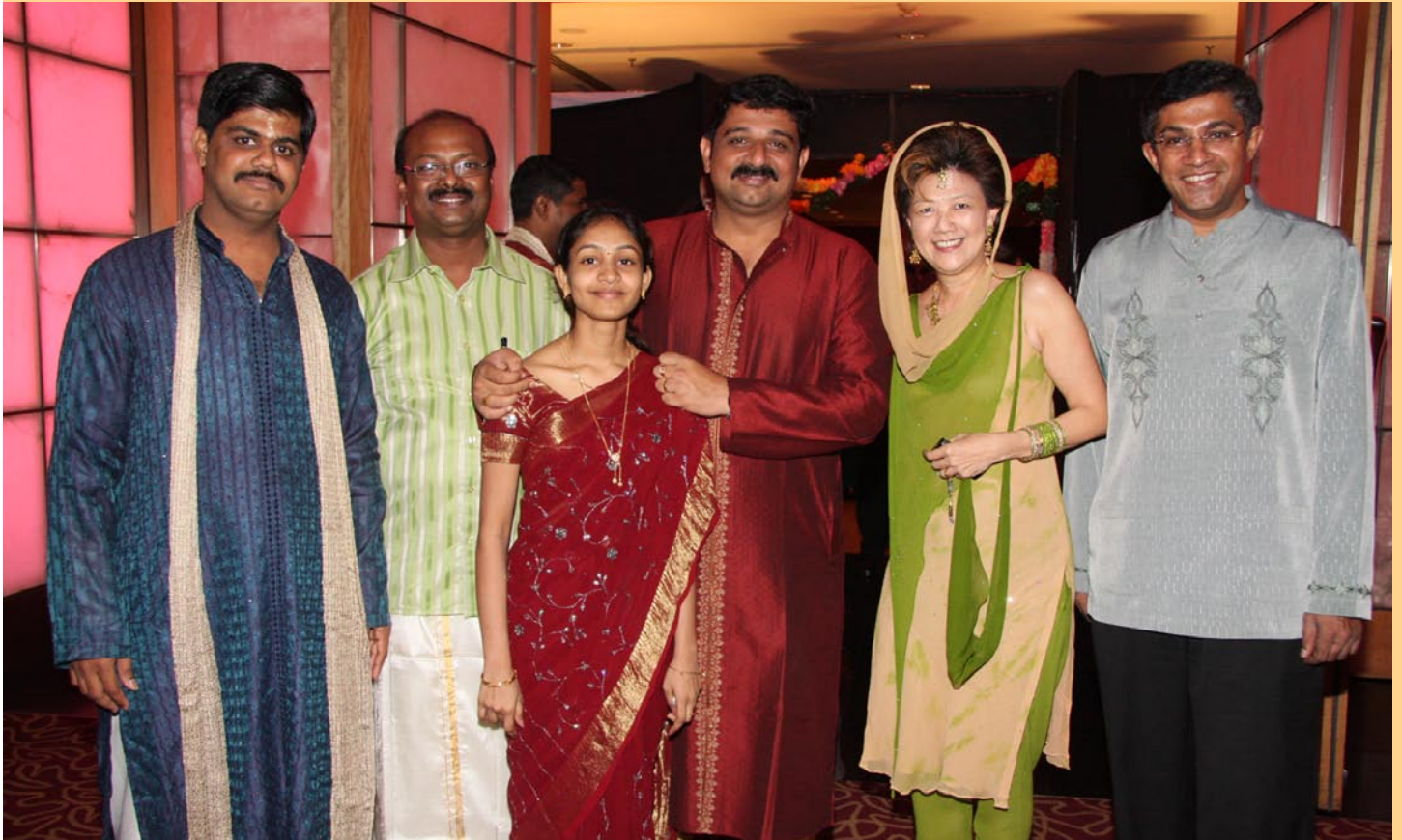
Welcoming YCHees from YCH India