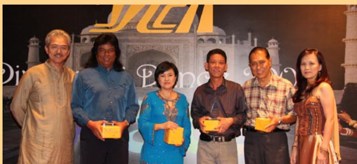
Our heartiest congratulations to our award winners