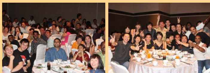
Guests and Staff having a whale of a time at YCH India Night