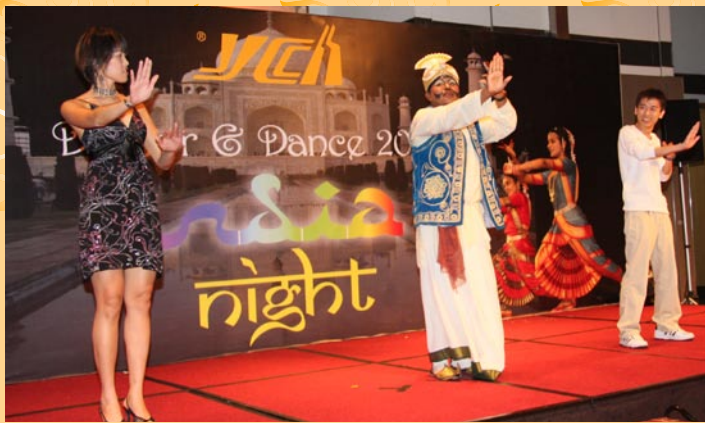
Comedian Mustaffa and sporting YCHees performing a boogie