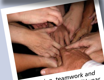
Cooperation, teamwork and cheers to a fantastic YCH year ahead!