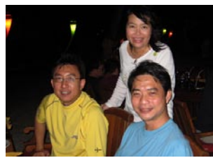
Enjoying the sea breeze during a BBQ dinner at the beachfront