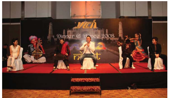
YCHairobics was choreographed in the fortnight leading to its launch at the YCH Annual Dinner & Dance 2008

Try it and feel the positive effects of higher energy levels, stress reduction and looking and feeling better during work.