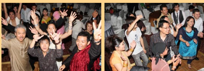
Dancing the night away after a very enjoyable dinner

Finally the annual Long Service Awards and Model Employee Awards were also presented to our dedicated employees. Congratulations, and our heartfelt admiration to all who were honoured at the event that night.