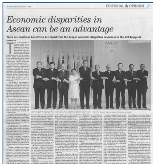
Business Times, 3 Jan 2008 (pg 21)