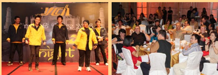
Launch of the YCHairobics by the Y-Talent Interns

The main crux of the Dinner & Dance however, was the special launch of the YCH Workout, also known as the YCHairobics exercise. The exercise, which comprised five basic steps to incorporate neck rotation exercises and stretching of the arms, legs, shoulders and back, was specially designed and choreographed by the YCH Interns under the Y-Talents program, in a bid to introduce a healthier way of living to YCHees during working hours. More information overleaf (?) on the YCHairobics.