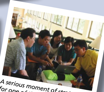
A serious moment of strategizing for one of the breakout groups