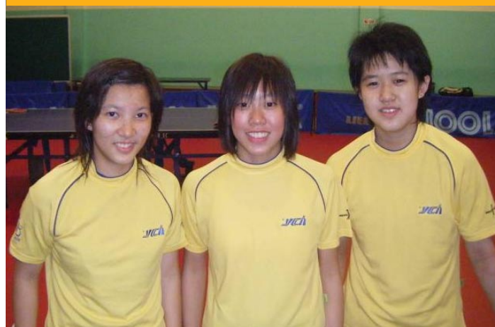
The trio displayed a terrific performance at the Table Tennis National Grand Finale 2007