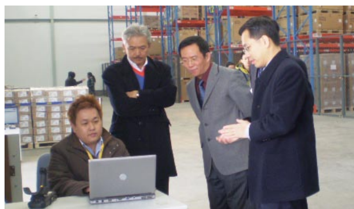
Staff administering the RFID system which enables real-time tracking and visibility like no other solutions